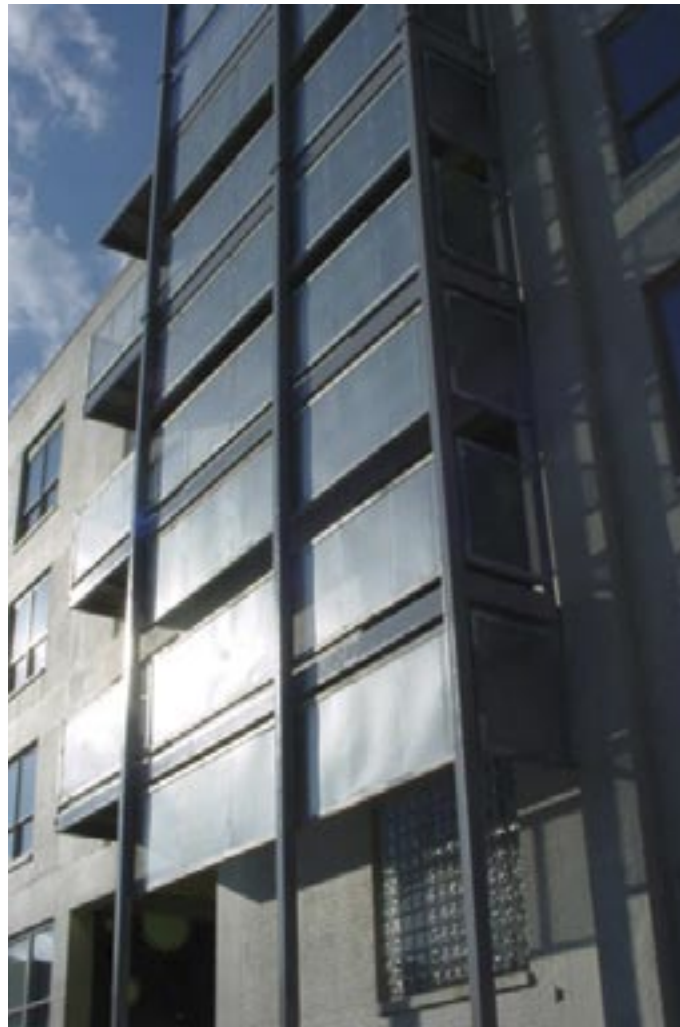
[Steel Balcony Screens]